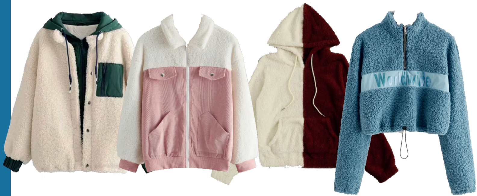
Teddy Sherpa Jackets; Lightweight featuring mixed media fabrics